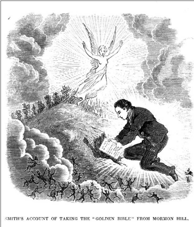
Figure 1. Frontispiece of Pomeroy Tucker's Origin, Rise, and Progress of Mormonism (New York: Appleton, 1867).