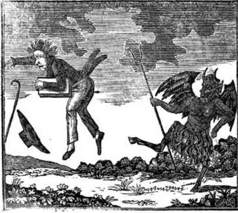
Figure 3. Frontispiece of E. D. Howe, Mormonism Unveiled .

the periphery of the angel's glory. Briggs mistakenly superimposed the image from the frontispiece of Mormonism Unveiled —depicting a story of the recovery of the plates in 1827—on his memory of Joseph recounting the shocking sensation he had experienced in 1823. Coincidentally, Howe himself would duplicate this conflation in his autobiography, which was published in 1878. 137