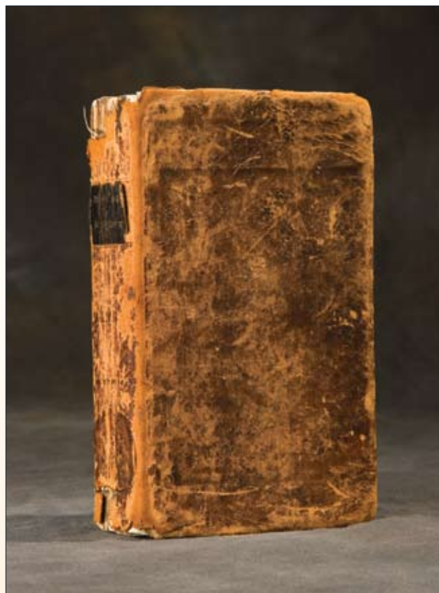
1830 edition of the Book of Mormon.