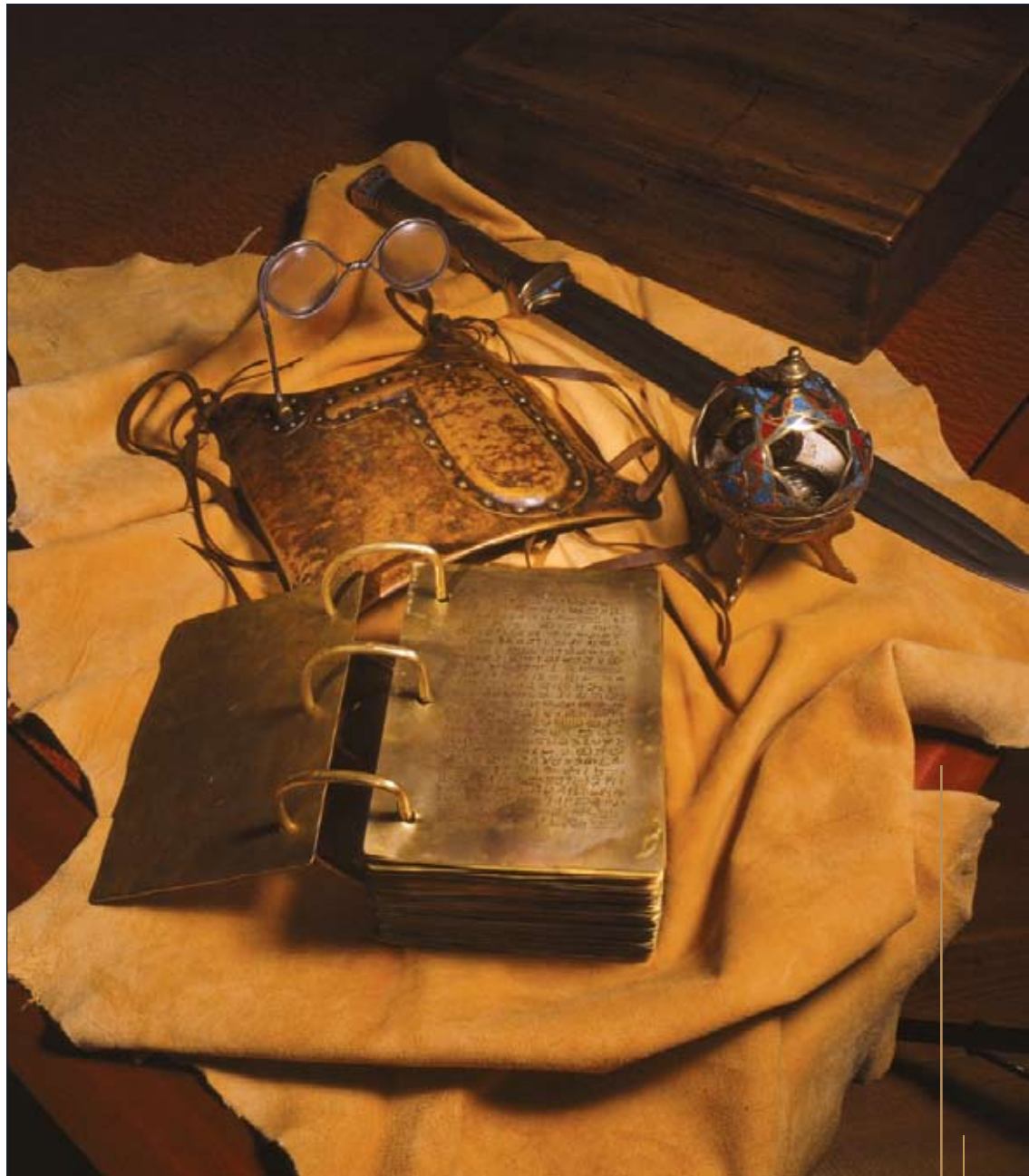
Artist's reconstruction of the Urim and Thummim (attached to the breastplate) and other Book of Mormon relics.

the coming of the great and dreadful day of the Lord." Moroni's quotation of that same verse reads, "Behold, I will reveal unto you the Priesthood, by the hand of Elijah the prophet . . ." (JS—H 1:38). Malachi 4:6 reads, "And he shall turn the heart of the fathers to the children, and the heart of the children to their fathers," whereas Moroni's words read, "And he shall plant in the hearts of the children the promises made to the fathers, and the hearts of the children shall turn to their fathers" (JS—H 1:39).