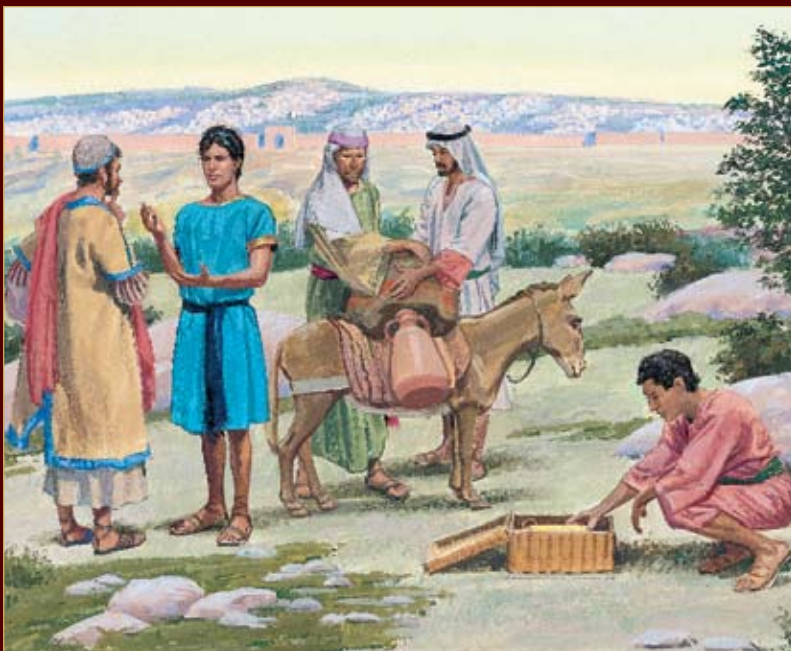
When Zoram and Nephi formed their covenant, Zoram became part of the party of Lehi. Zoram and his descendants remained true to the covenant for hundreds of years.

Like Nephi, each of the three are prophets. Like Nephi, Benjamin wields the sword of Laban in his people’s defense and holds them accountable to obey his words, which are the words of God (Words of Mormon 1:12–18). Though he exercises sovereign power like Nephi in punishing those who “murder, or plunder, or steal, or commit adultery,” Benjamin has taken care to preserve freedom and equality among his people. He has not permitted them to “make slaves one of another” and he himself has “labored with [his] own hands that [he] might serve [them], and that [they] should not be laden with taxes” (Mosiah 2:13–14). He plainly states that he sees himself as no better than his people: “My brethren . . . hearken unto me. . . . I have not commanded . . . that ye should fear me, or that ye should think that I of myself am more than a mortal man. But I am like as yourselves. . . .” (Mosiah 2:9–11). Thus, the relationship between these last three kings and the people is in every way