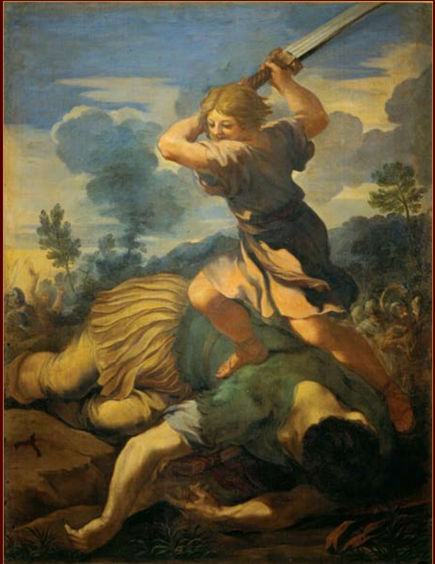
Like Nephi, the biblical David became the leader of the people through slaying a mighty man (Goliath) with his own sword. David Slaying Goliath, by Pietro da Cortona.

After Moses, the greatest exemplar of sovereign power in ancient Israel was David. In recount-