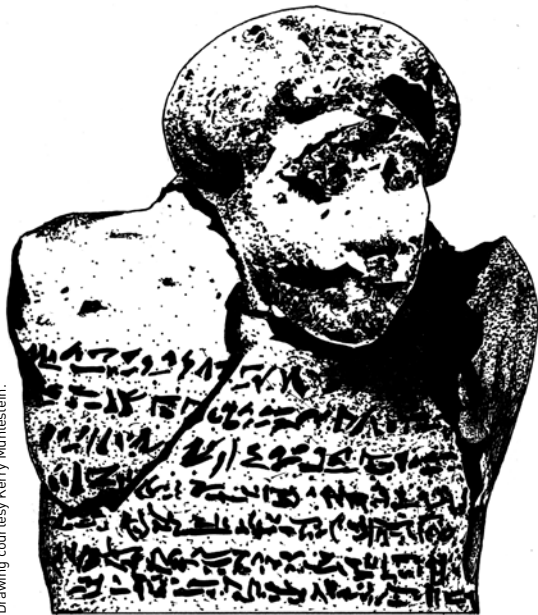
Egyptian execration figurine found at Saqqara, 19th–20th century bc. Execration figurines were usually wax figures substituting in effigy for a human sacrifice; this one, however, was made of clay.

(Abraham 1:7–9, 11, 15) and a “sacrifice” (Abraham 1:7); it is even termed a “thank-offering” in one case (Abraham 1:10); and “it was done after the manner of the Egyptians” (Abraham 1:11), indicating that something about the way the sacrifice was enacted was Egyptian (as opposed to local or Mesopotamian) in nature.