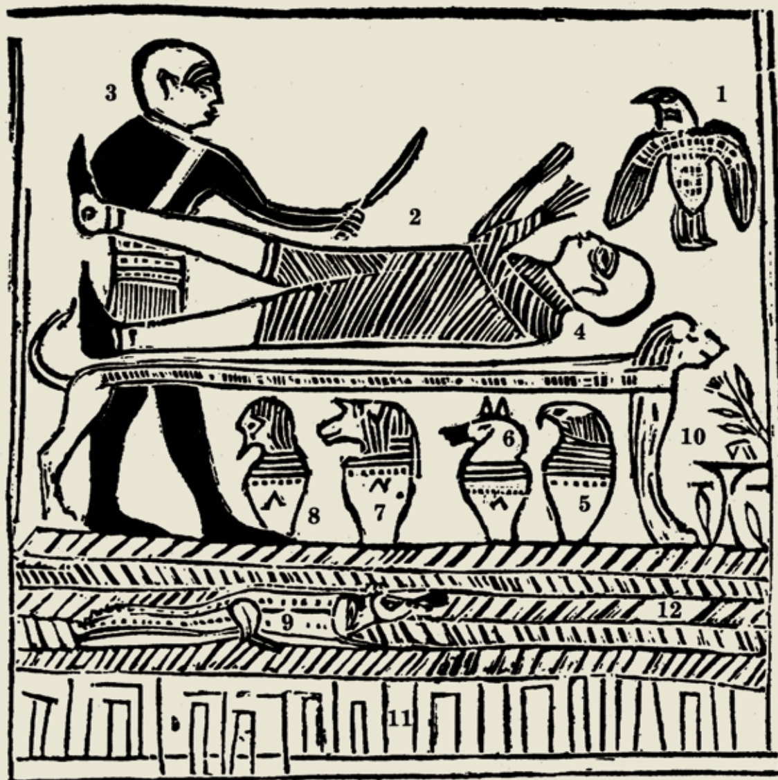
In this facsimile from the Book of Abraham, Abraham is on a similar-looking lion couch, which “was made after the form of a bedstead” (Abraham 1:13). Facsimile 1, July 1842 Millennial Star .

Understanding this definition is somewhat hampered by a modern tendency to compartmentalize that which ancient societies were not prone to view